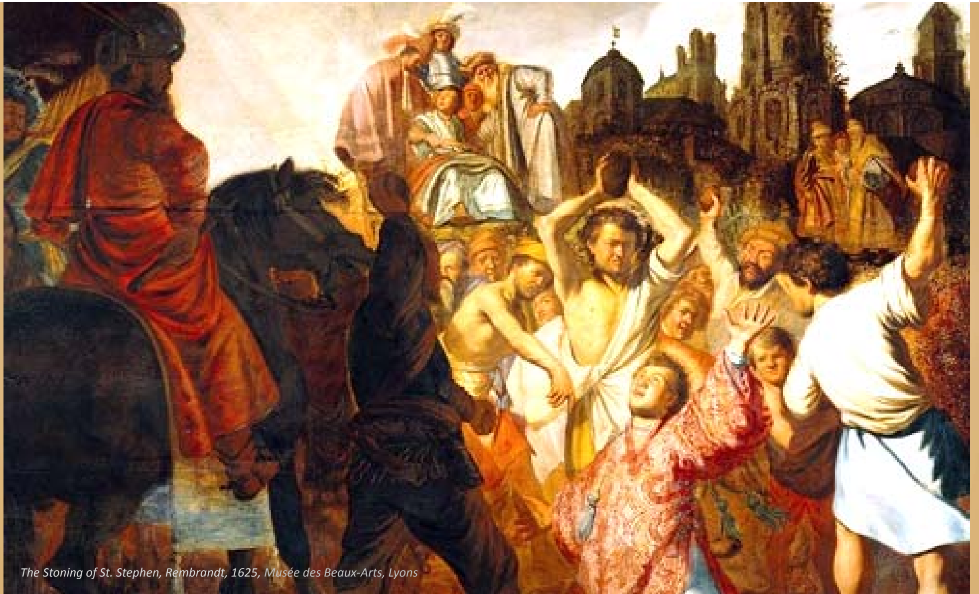
The Stoning of St. Stephen, Rembrandt, 1625, Musée des Beaux-Arts, Lyons