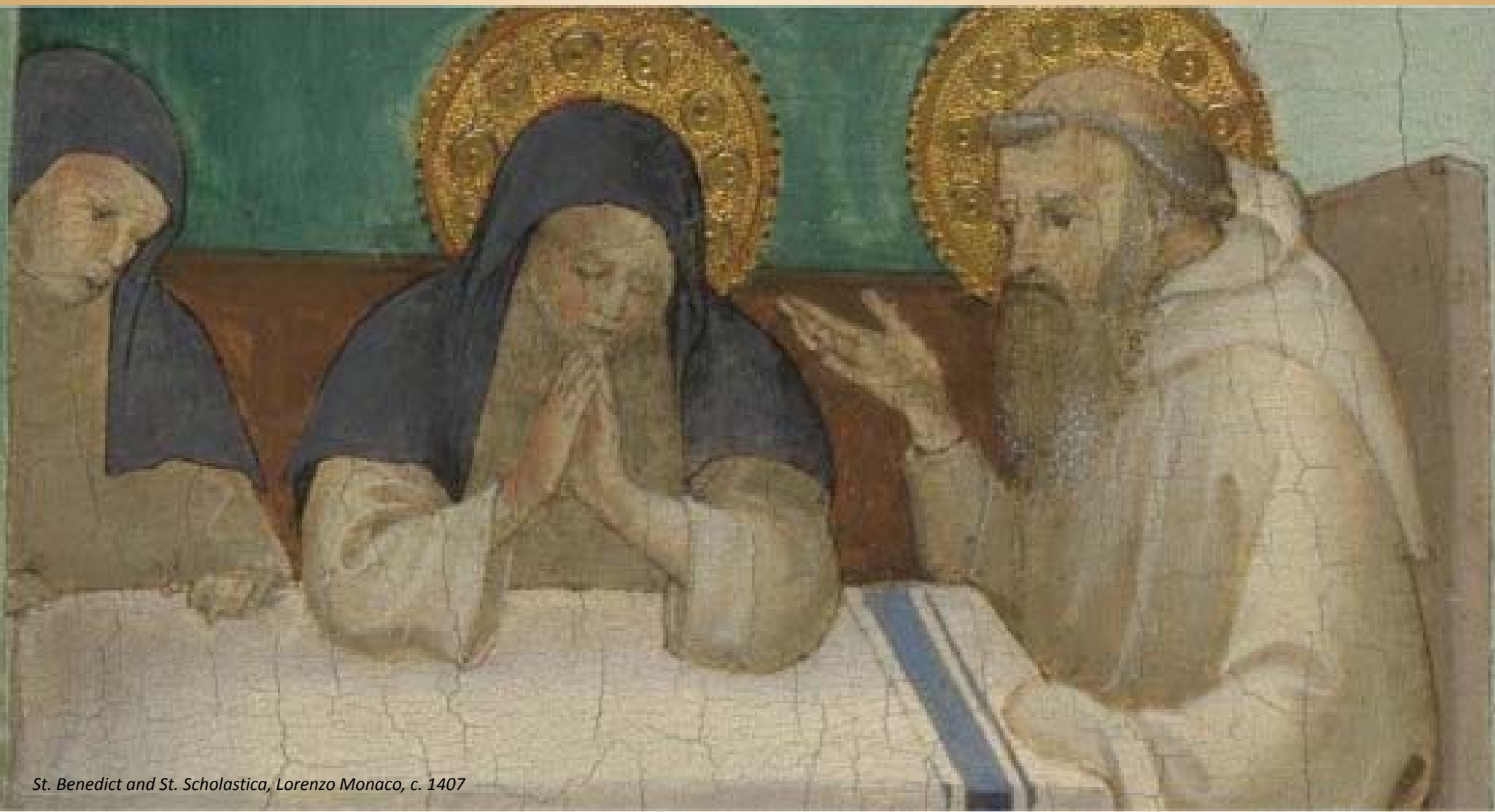
St. Benedict and St. Scholastica, Lorenzo Monaco, c. 1407