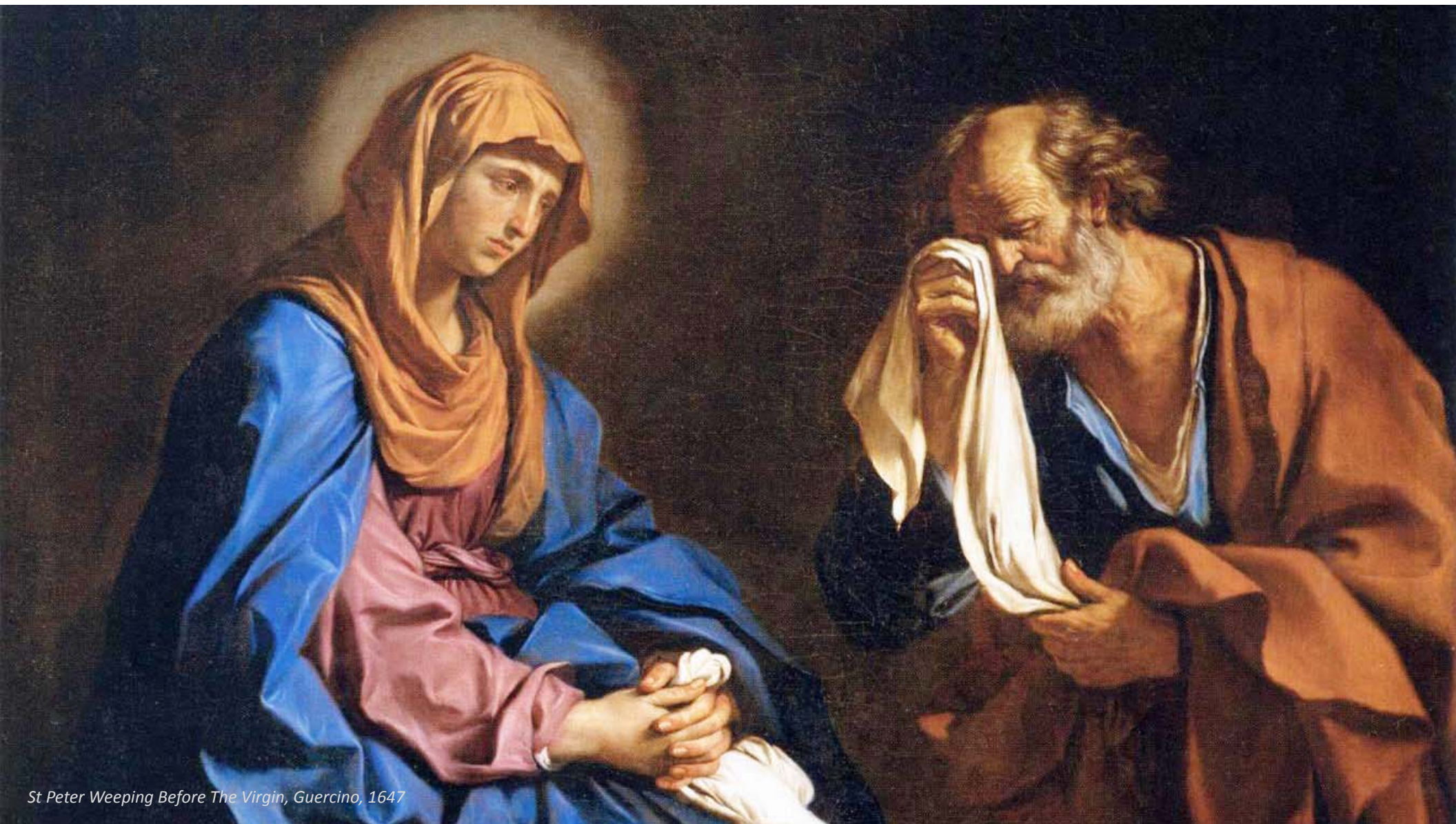
St Peter Weeping Before The Virgin, Guercino, 1647