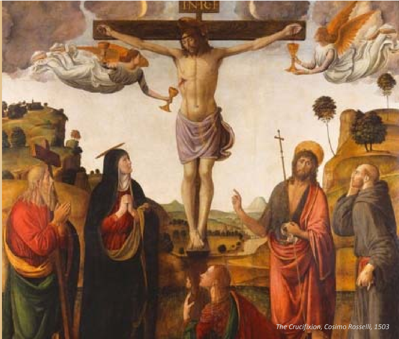
The Crucifixion, Cosimo Rosselli, 1503